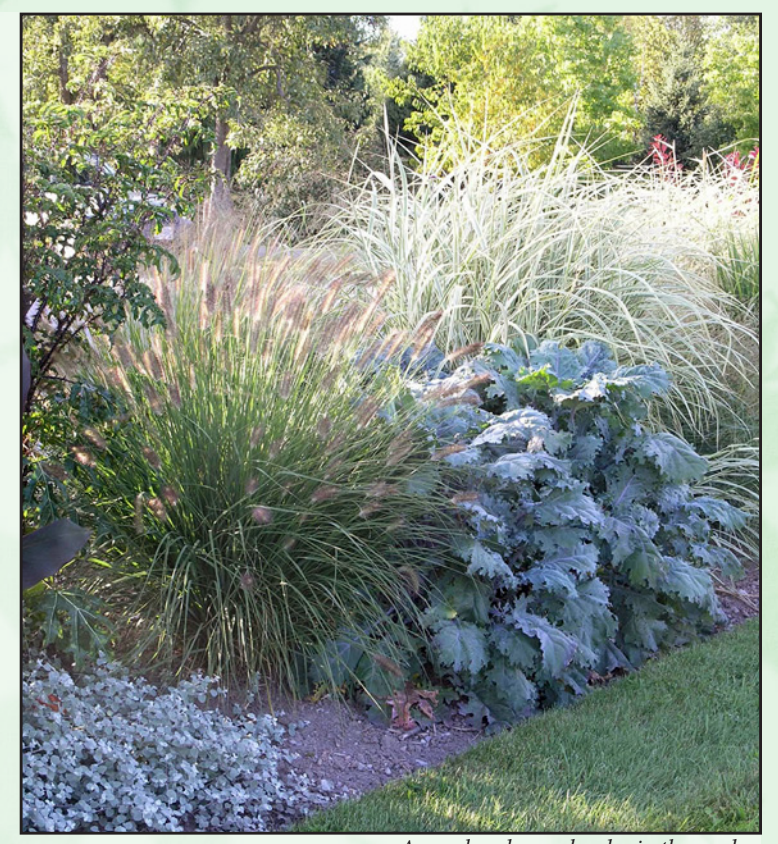
Annual and grass border in the garden.

consideration when selecting plants for my own garden is their degree of maintenance; low maintenance!