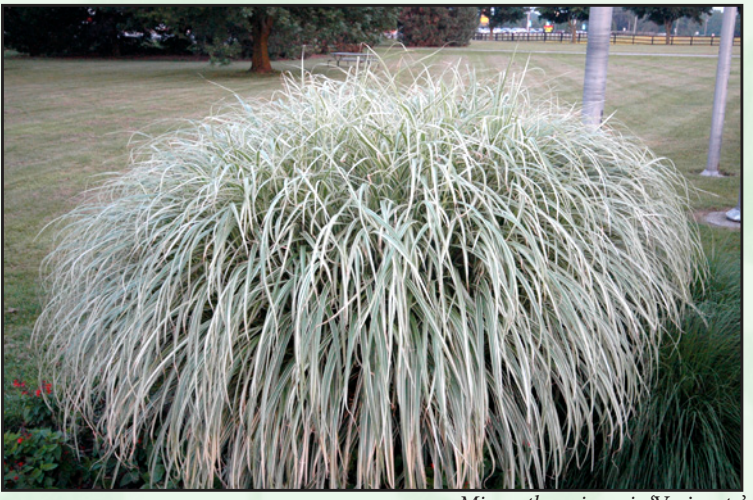
Miscanthus sinensis 'Variegata'

My favourite is Miscanthus sinensis 'Variegatus', the Variegated Silver Grass. The heavy white edges of the leaves in-filled with light grey-blue-green lend this plant a regal appearance as it graces the front approach to my house. As with most of the Miscanthus species and cultivars, it is a reliable clump former and dispels the myth about not using ornamental grass because they are invasive. If I was to encourage a first-timer to plant ornamental grass this would be my first recommendation.